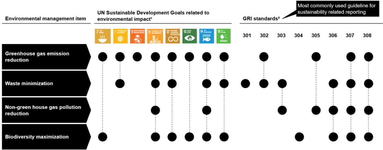
Figure 1. Scope of UNSDG and GRI frameworks.

Within this article, environmental responsibility is split into four main components: greenhouse gas emission reduction, waste minimization, non-greenhouse gas pollution reduction, and biodiversity maximization. These major topics are usually considered in environmental disclosures through well-known frameworks, such as the United Nations Sustainable Development Goals (UNSDG) or the sustainability reporting standards provided by the Global Reporting Initiative (GRI). It should be noted that both frameworks cover the abovementioned components extensively.