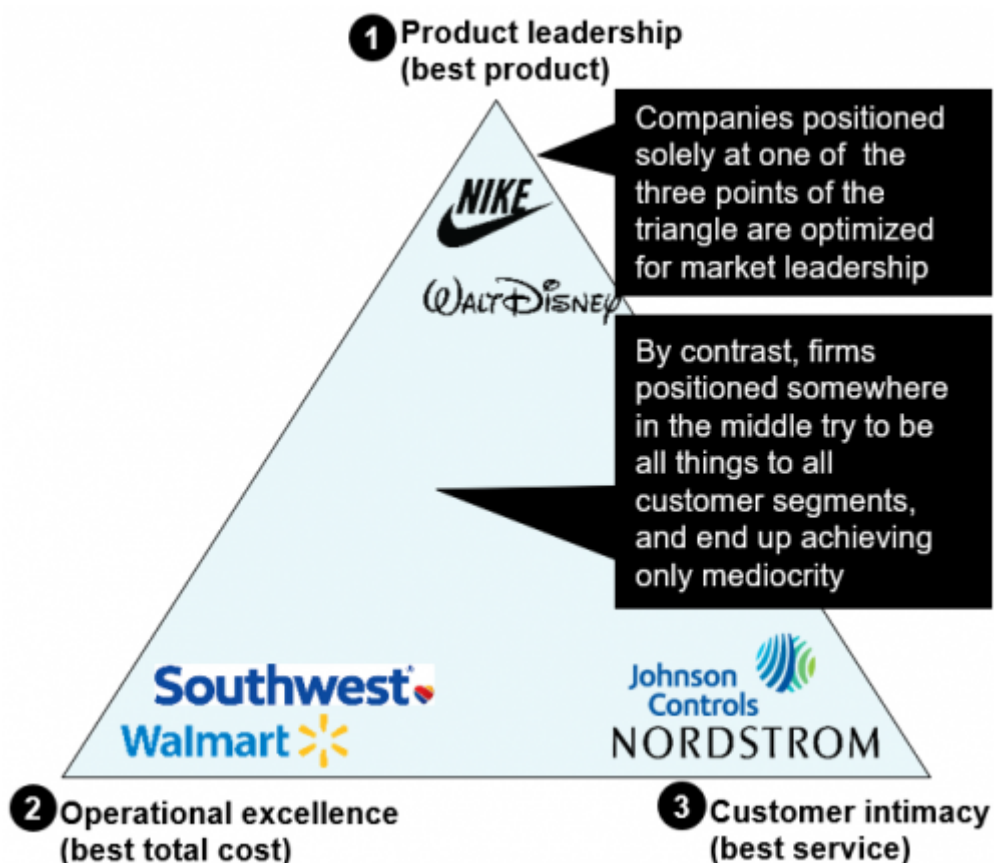
Figure 2. Value disciplines and examples of market leaders in each discipline.[4]

According to Treasy and Wirsema (1995), a market leader must excel in one of the value disciplines, either in operational excellence, product leadership or customer intimacy. Delivering value to customers in one specific value dimension enables companies to focus and exceed customer expectations and beat competitors in the area that matters most to their customers. On the other hand, a company trying to excel in everything risks becoming an average player in all value dimensions – and thus is not able deliver superior value in any dimension.