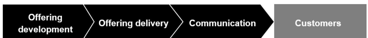
Figure 1: Traditional linear offering development process

In a traditional approach (figure 1), a product is at the forefront of the offering development process: a product is developed, after which potential customers who would need that product are identified and marketing and sales activities take place to generate business.